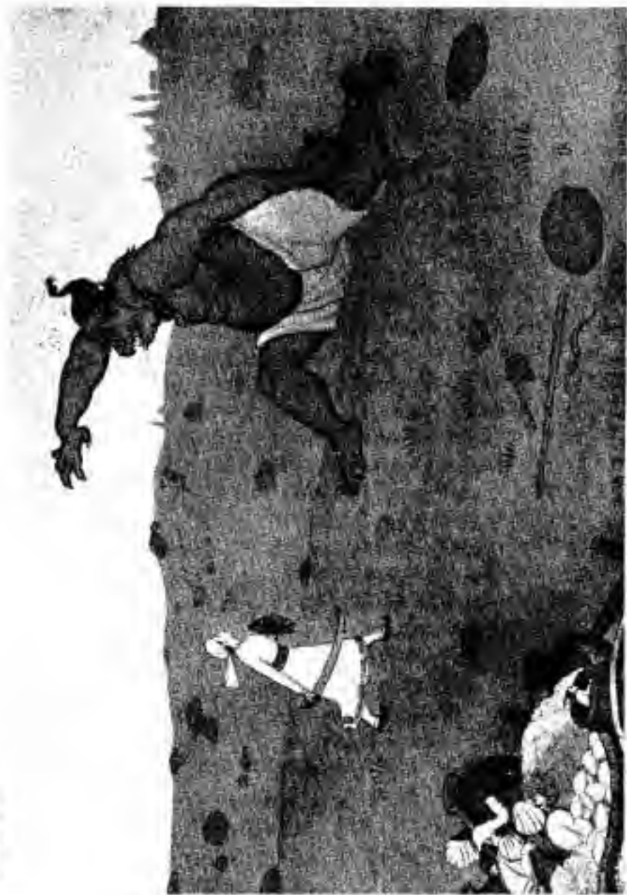
Shamsheer Jang attacks the giant.